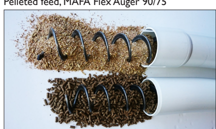
Crushed grain, MAFA Flex Auger 90 Pelleted feed, MAFA Flex Auger 90/75