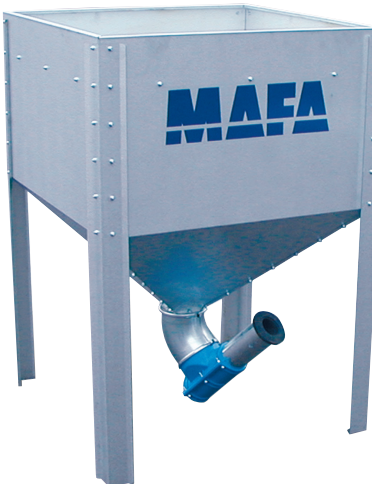
MAFA Midi is the largest model, holds 730 liters.