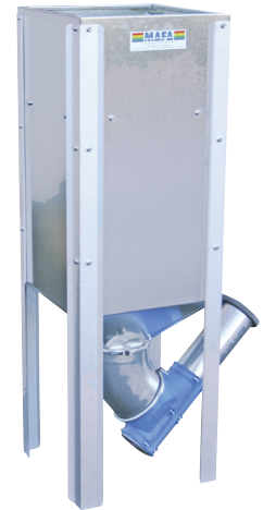
MAFA Micro is the smallest model, holds 127 liters.