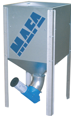
MAFA Mini holds 300 liters + possibly 200 liters = 500 liters with extension section.

MAFA Micro, Mini and Midi can be used as intermediate storage for bulk deliveries. They can be fitted with a lid and a sensor and are refilled automatically from the primary silo with either a vacuum system, or a traditional Maflex auger. Micro, Mini and Midi are manufactured in durable galvanized plate and are provided with a 45° cone which ensures efficient and complete emptying. Standard features include an internal grid that functions both as protection and support when filling with bagged pellets, and a 100 mm adjustable auger inlet which is easily adjusted to fit the different types of wood pellet augers available in today's market.