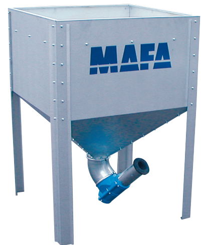
MAFA Midi is the largest model, holds 730 liters.